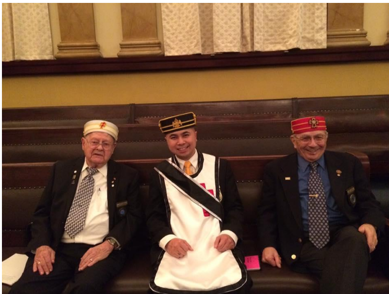
The heart and soul of the Valley of Bremerton