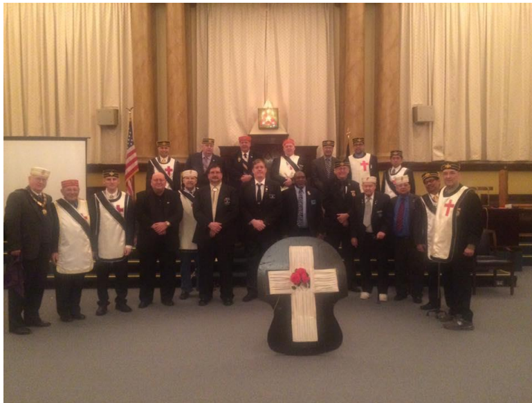
18 th Degree Team with Spring 2016 Class Members