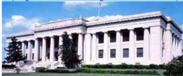
SCOTTISH RITE TEMPLE, GUTHRIE OK.

http://guthriescottishrite.org/reunionschedule.aspx